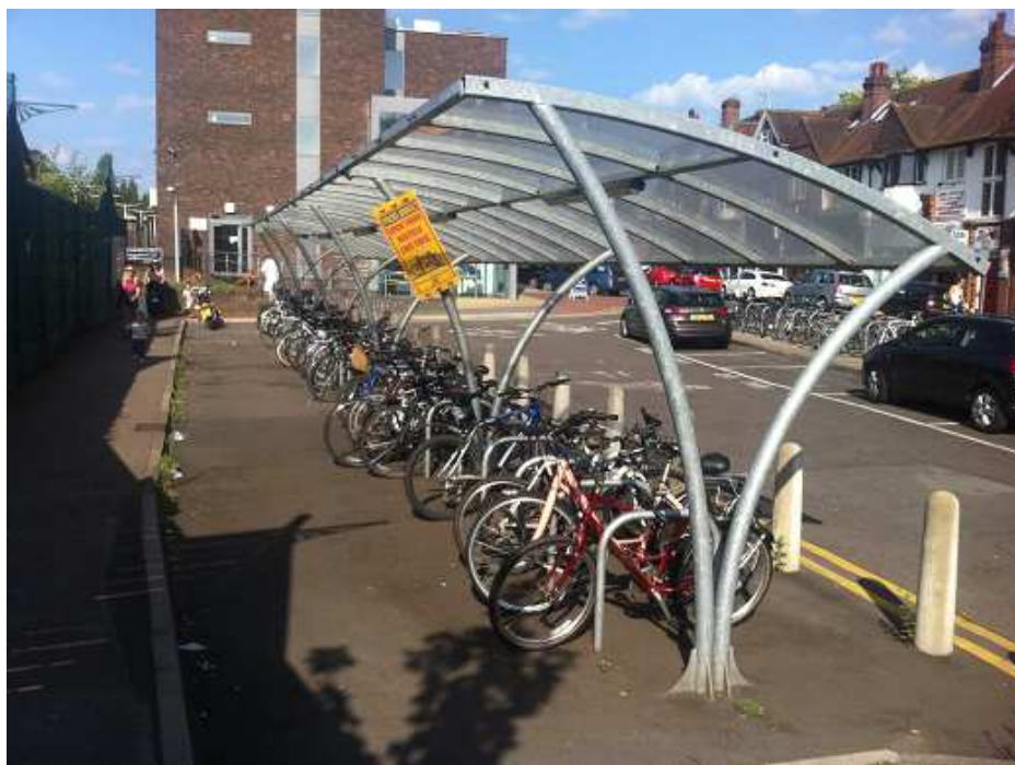
Figure 1: Existing cycle parking provision

A need for improvements to cycle parking at West Byfleet Station has been identified. A site visit carried out in August 2014 to investigate current levels of provision and potential improvements revealed a shortage of cycle parking on the south side of the station. During weekdays, all of the spaces are full with bicycles locked to street lights and other street furniture.